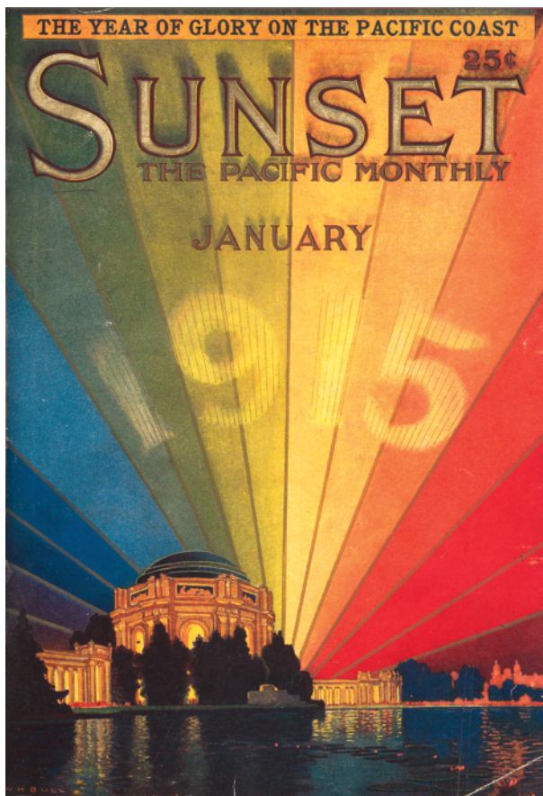
Fig 1. Cover, Sunset , vol. 34, January 1915.

1998) offer a comprehensive analysis of America's influence on Australian popular culture, law, government, sexual politics, literature and language. David Goodman (Allen and Unwin, 1994) has considered the shared history of gold-rushes in Victoria and California, and Ian Tyrell (University of California Press, 1999) has compared the Californian and Australian environmental reform of the nineteenth and early twentieth centuries Esau points out, as California and Australia share the Pacific region, have similar climates, common languages, material trade and shared concepts of law and democracy, comparative histories are perhaps inevitable, and indeed these common factors in some way inform most of her case-study analyses. But at the basis of Esau's comparison of Californian and Australian aesthetics is her point that both were 'cultures on the periphery' in the nineteenth century, both were looking to form identities that diverged from those of their home cultures, whether 'back East' in America, or England in the case of Australia, and both were looking for new aesthetics of place (p. 18). She finds that vernacular imagery in the reproductive arts of the mass media: photography, illustration and graphic design.